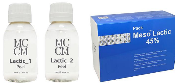
PROFESSIONAL 100 ML