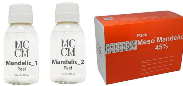
PROFESSIONAL 100 ML